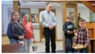
Palm Sunday March 24