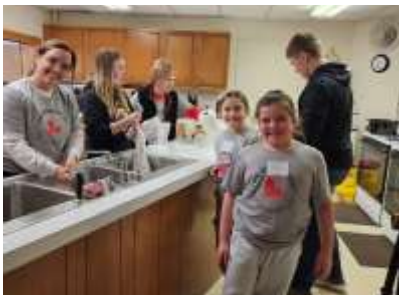
Lenten Soup Suppers